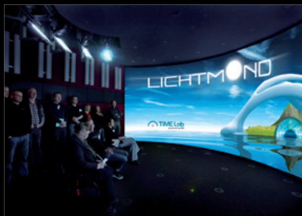
180°panorama projection at Fraunhofer Time LAB

LICHTMOND and the well reputed Fraunhofer Heinrich-Hertz-Institute (HHI) – Germany started a cooperation. The production of videos in the highest resolution and inherent music at the TiME Lab , developed by the Fraunhofer HHI. The HHI